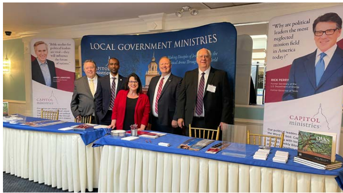
CapMin team members prepare to interact with more than 60 people who expressed interest in helping lead a Bible study to local government officials.