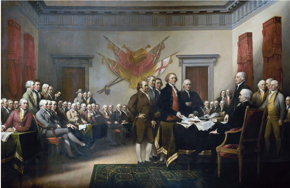
“Declaration of Independence” painting by John Trumbull, 1819, oil on canvas, U.S. Capitol, Washington, D.C.