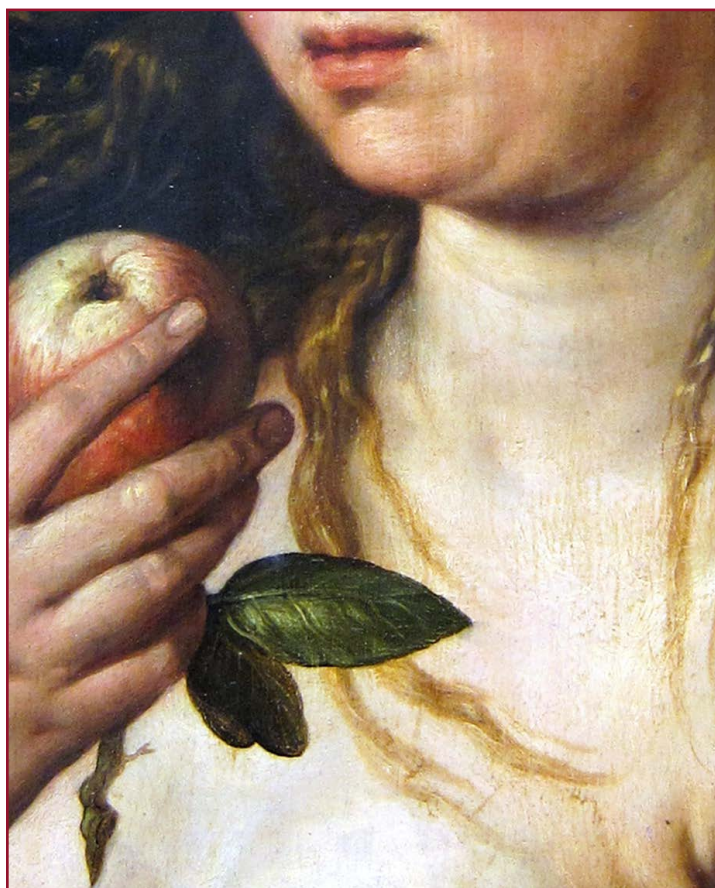
“Eve,” Hendrick Goltzius (1558–1617), Musée des Beaux-Arts de Strasbourg

M any people currently do not believe in the total depravity of man; however, Scripture is clear that man is fallen. In fact, God ordained the institution of government primarily to restrain the latent sin nature of man: to believe the opposite—that man is basically good—is to reject scriptural truth.